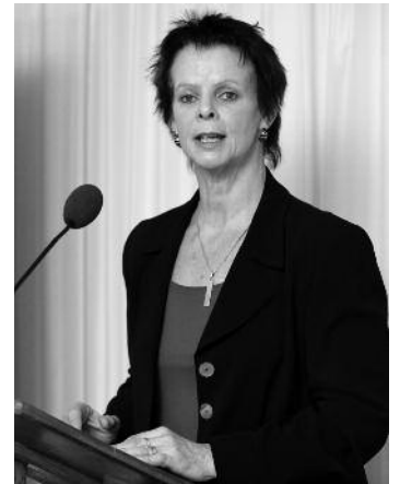
Anne Milton MP, Parliamentary Under Secretary of State for Public Health